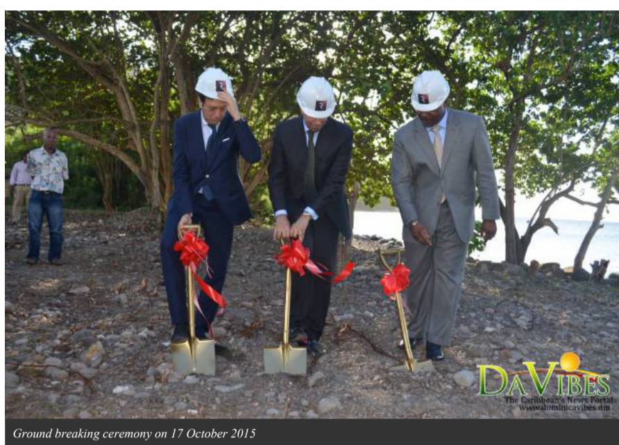
Ground breaking ceremony on 17 October 2015

Range Developments, who has been awarded the contract for construction of the first Kempinski first luxury hotel in the Caribbean, has announced the appointment of NH International (Caribbean) Ltd (NH) as the main structural contractor for the Cabrits Resort Kempinski, Dominica.